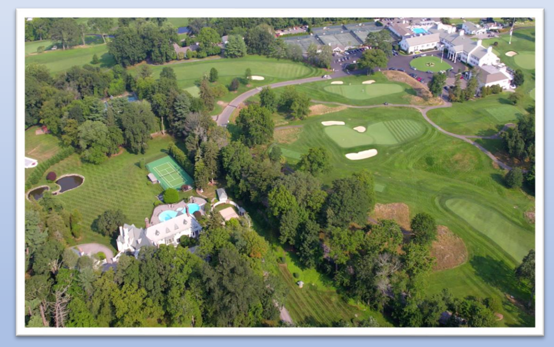
25 Doubling Road, Greenwich Purchased October 2021

A key metric of a club's fiscal standing includes the growth of members' capital net worth over time, reflecting market relevance and competitive standing. The recent investment in purchasing a contiguous property ensures the Club will achieve 100% of its strategic capital goals, which were limited previously due to a constrained physical footprint. Critical drivers of sound governance decisions are structured to improve and enhance the overall Greenwich Country Club member experience.